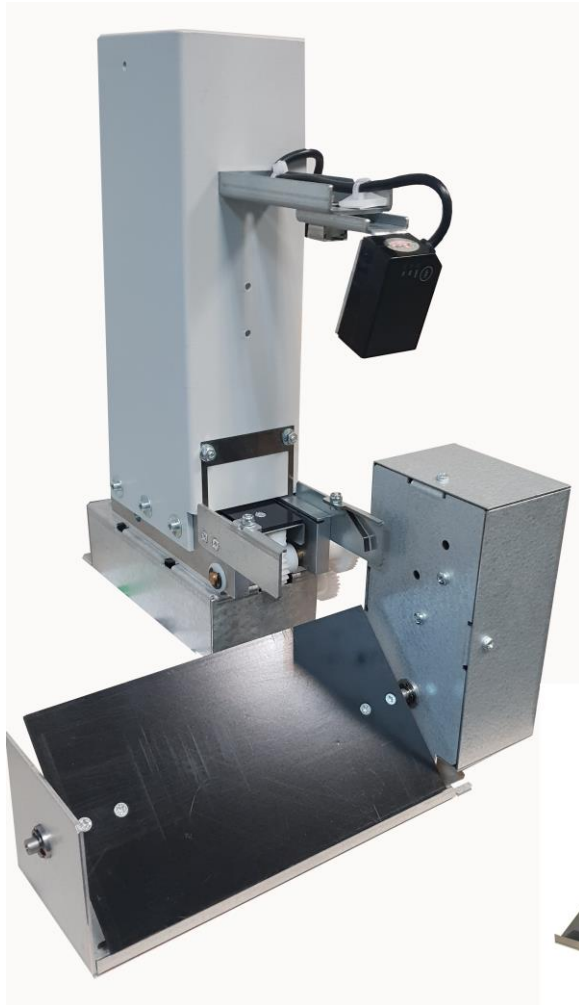
WS45-2 which DE5245BCR1D